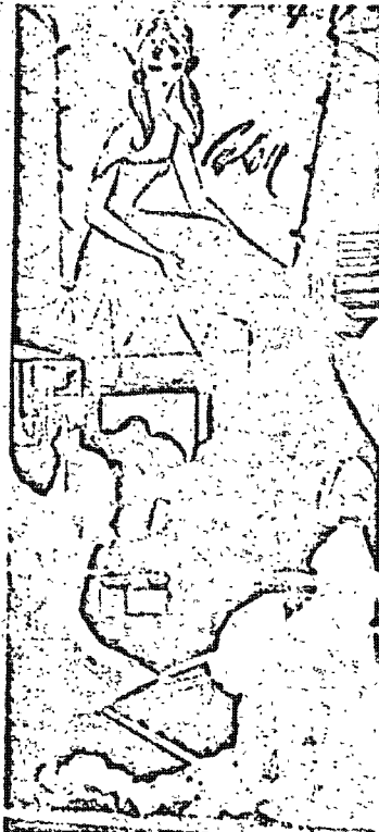
... lingerie at GUM...