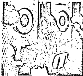
... and gossip at the Laundromat