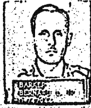
Photo taken circa 1945 after return to U.S. as wounded POW