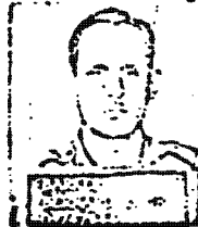
Photo taken circa 1945 after return to U.S. as wounded POW