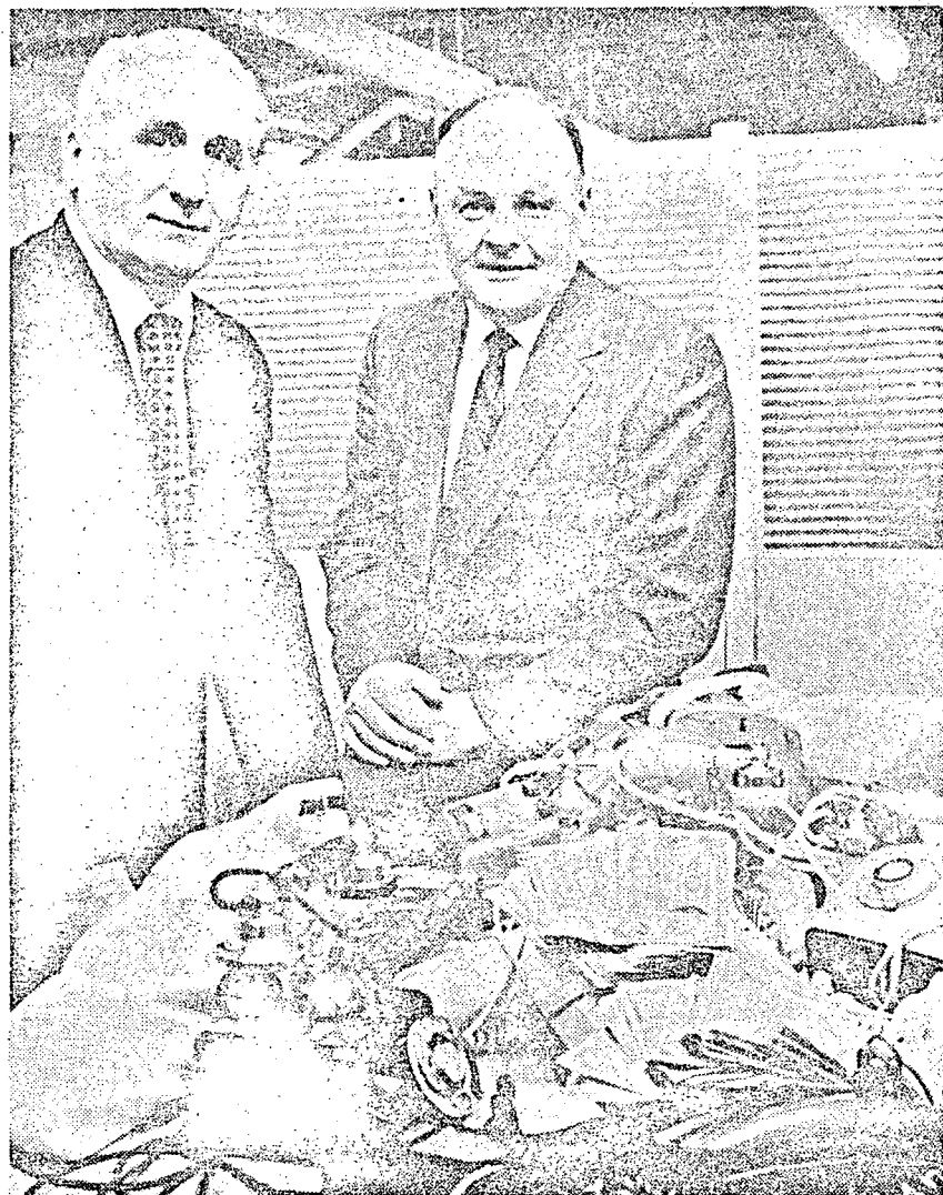
New Jersey Newsphotos