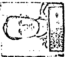
Photo taken since 1945 after return to U.S. as wounded POW