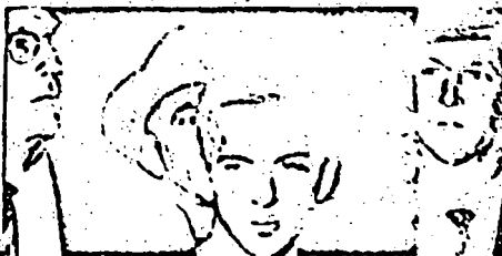
Oswald and people