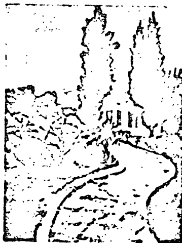
Сочи. Домик Н. А. Островского