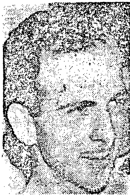
Lee Harvey Oswald

"It was determined that none of these photographs was the