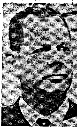
JUDGE ARTHUR FAQUIN

NO OBJECTION TO DECLASSIFICATION AND/OR RELEASE OF THIS DOCUMENT