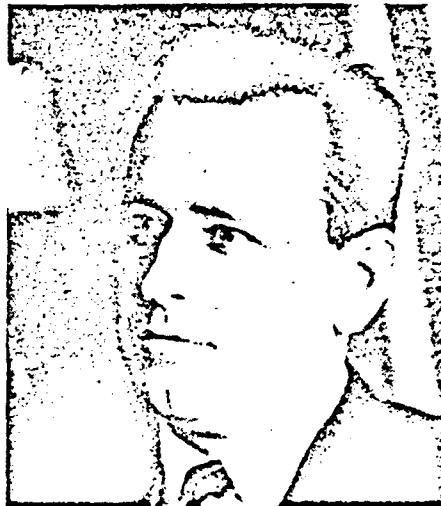
JAMES EARL RAY: subject of "most massive manhunt ever undertaken" by FBI.

Meanwhile, investigators have kept looking for leads in other places to