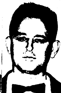
JAMES EARL RAY FBI No. 405,942 G