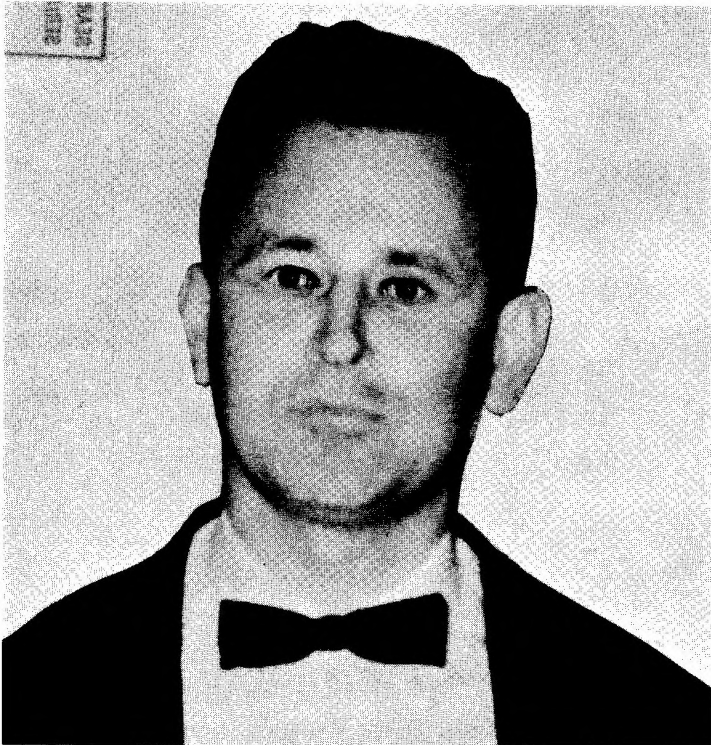
Photograph taken 1968 (eyes drawn by artist)