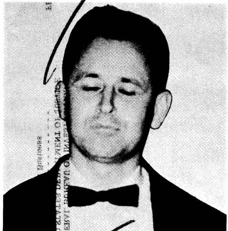
Photograph taken 1968