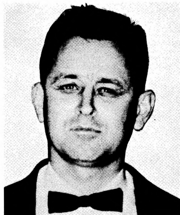
Photographs taken 1960