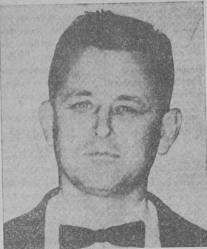
JAMES EARL RAY , also known as Eric Starvo Galt, Harvey Lowmyer, John Willard, James McBride, James Walton, W. C. Herron and James O'Conner.

James Earl Ray, a Missouri prison escapee, sought under the alias Eric Starvo Galt in connection with the gunshot slaying of civil rights leader Dr. Martin Luther King, Jr., is one of the FBI's "Ten Most Wanted Fugitives." FBI Director J. Edgar Hoover ordered the special addition of Ray to the "Top Ten" list to insure widespread dissemination of Ray's photograph and description to speed his location.