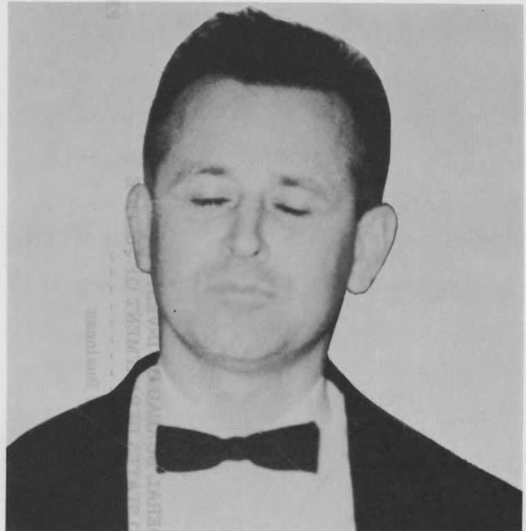
Photograph taken 1968