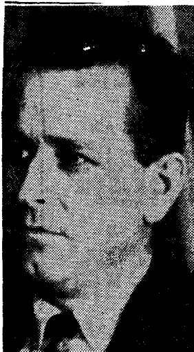
SUSPECT —The FBI released newly obtained photographs of James Earl Ray, the ex-convict sought in the slaying of Dr. Martin Luther King Jr.

(Indicate page, name of newspaper, city and state.)