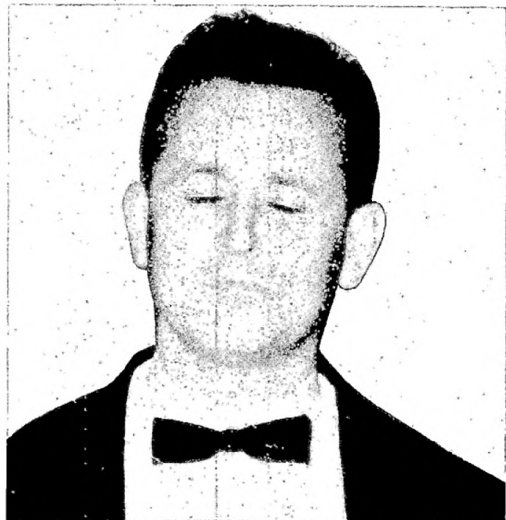
Photograph taken 1968