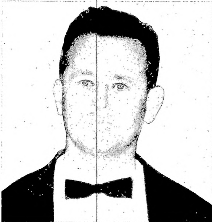
Photograph taken 1968 (eyes drawn by artist)