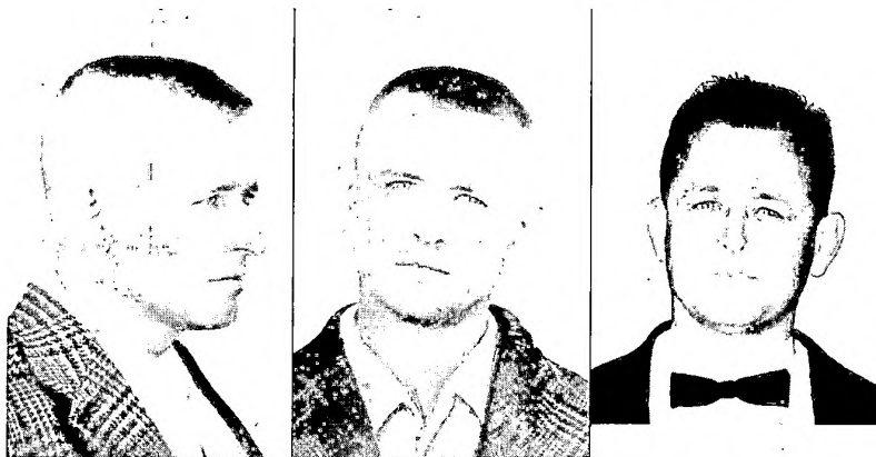
Photograph taken 1968 (eyes drawn by artist)