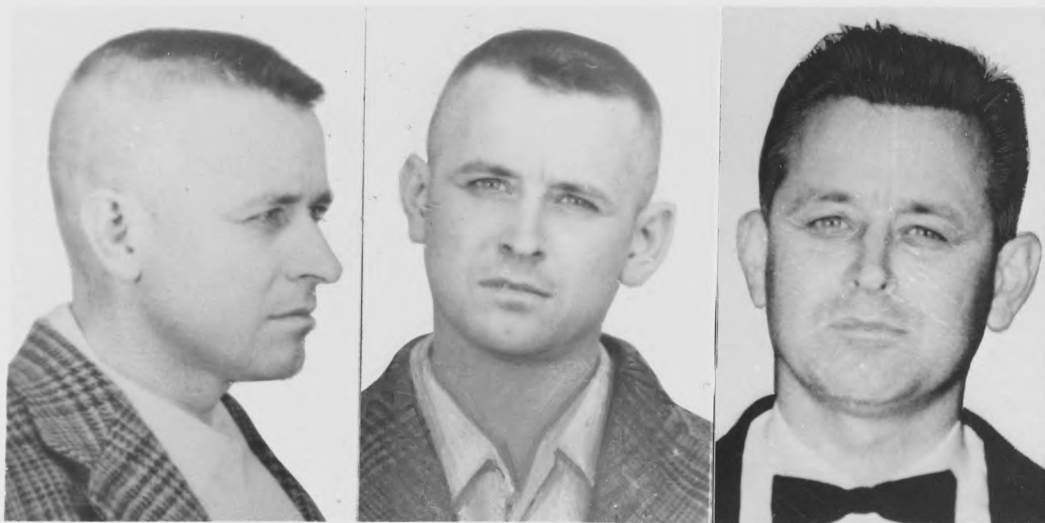
JAMES EARL RAY FBI No. 405,942 G