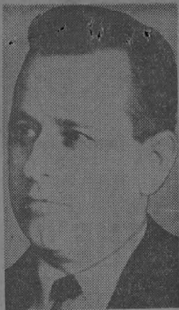
JAMES EARL RAY Latest photo of slay suspect.

to vary widely. The Mexican discloses a man with a