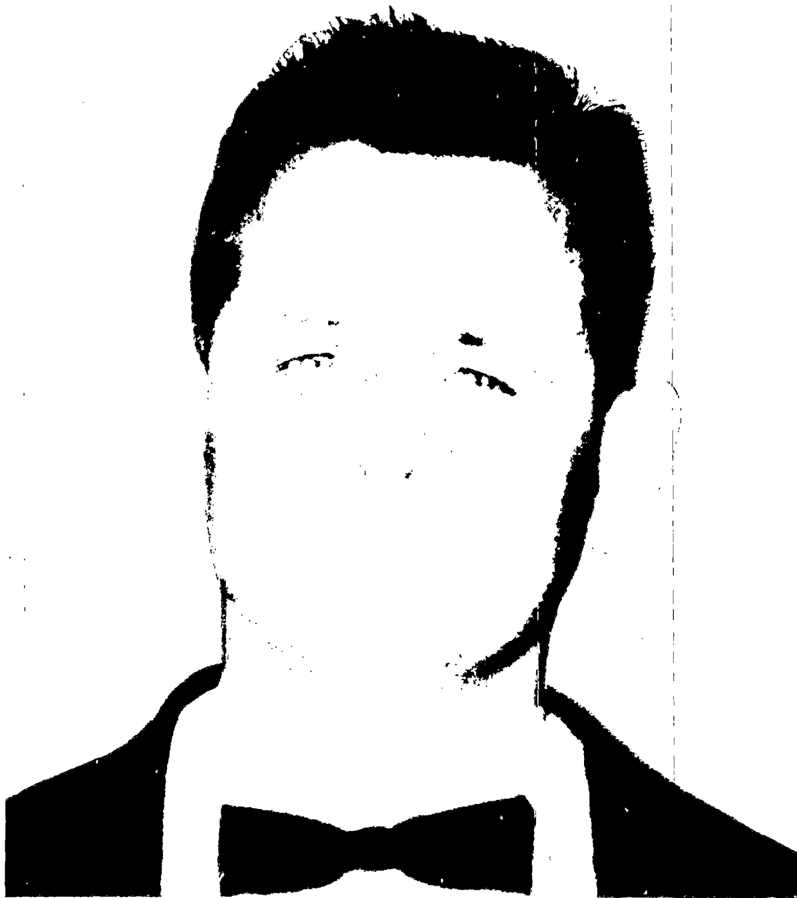
JAMES EARL RAY