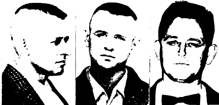
JAMES EARL RAY FBI No. 405,942 G