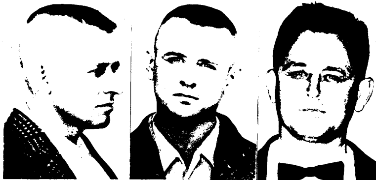
JAMES EARL RAY FBI No. 405,942 G