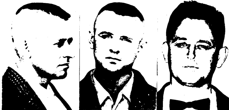
JAMES EARL RAY FBI No. 405,942 G