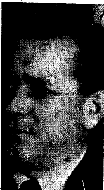
JAMES EARL RAY

Pottsville, Pa., asked the FBI to supply a dental chart of Ray to determine if they may match a corpse found there.