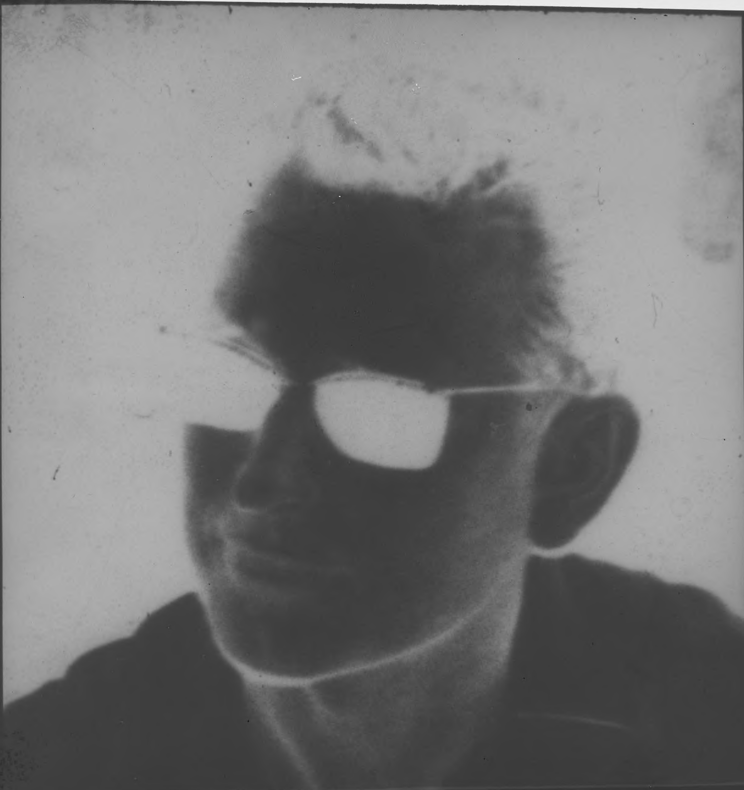
JAMES EARL RAY