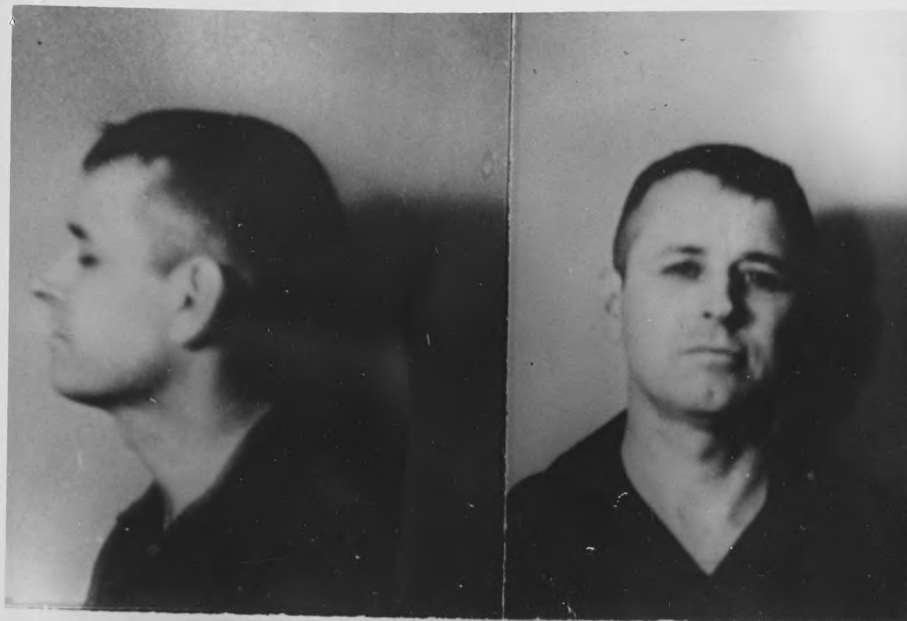
JAMES EARL RAY