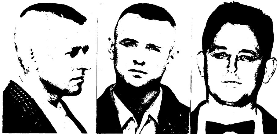
JAMES EARL RAY FBI No. 405,942 G