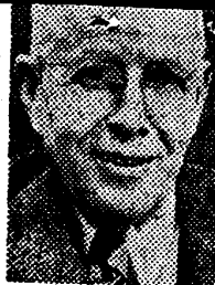
DR. WALTER C. ALVAREZ

An able skin specialist, a friend of mine, tells me a high percentage of the people whom he sees nowadays with an inflamed patch of skin are suffering from irritation produced by some new detergent, kitchen soap, antiperspirant, hair spray, facial cream, hair tonic, hair pomade, or perhaps poison ivy. When a patient has a skin eruption, the essential part of the treatment is not prescribing an ointment, but is finding what is producing the inflammation, and then getting rid of that. As I often say to people, "What you must do is to