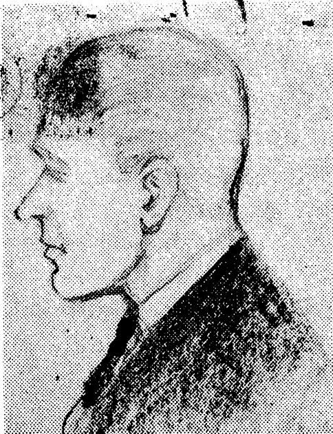
Artist's sketch of King assassin, drawn from descriptions.

"The police dispatcher relayed seven transmissions — supposedly from Lt. Bradshaw in car 160 — between 6:35 p.m. and 6:47 p.m. last Thursday," the paper said, "little more than a half-hour after Dr. King was shot by a sniper outside the Lorraine Motel." The paper said the messages described the route of the chase, said that a blue Pontiac was also chasing the Mustang and said shots were fired from the Mustang at the Pontiac.