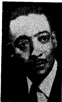
★ LOUIS LOMAX