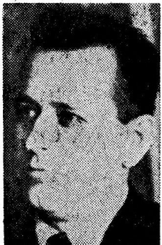
... in California

(Indicate page, name of newspaper, city and state.)