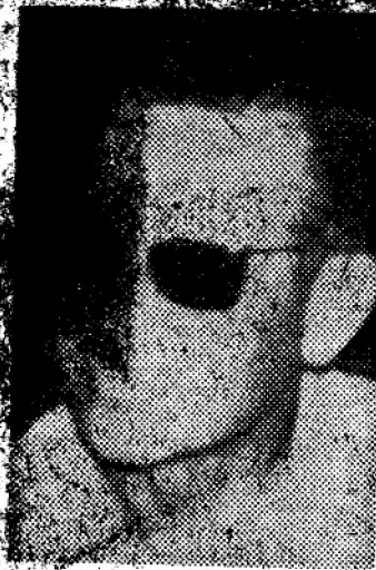
New Photos of Ray ... in Mexico

The civil rights leader was shot on a motel balcony April 4 by a rifleman. Ray is believed to be in a bathroom.