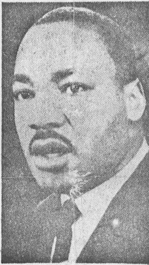
Martin Luther King

Along the city's tough waterfront between Place Royale and Place d'Youville where he spent much of his time in hopes of obtaining false identity papers, no one could