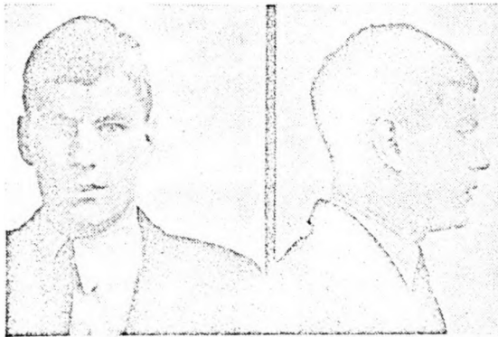
Photograph taken 21-10-66

e. hazel, scar chin. back of hands. Sentenced to B.T. at C.L.S., 26-3-64, for house-breaking w.i. Released, 24-11-66, to Care of Borstal Division. C.A.C.A. Cons. for larceny, taking motor vehicle without consent, housebreaking, etc., at M.P. (D, H and N). If found to be in honest employment, Order of Recall should not be enforced, but report forwarded for information of Home Office, Prison Dept. Supn. expires, 23-11-68, after which date he should not be arrested on the Order.