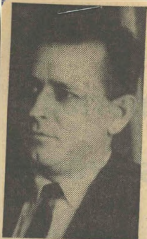
NEW PHOTO: Albuquerque FBI agents Tuesday released this recent picture of James Earl Ray, wanted in connection with the slaying of civil rights leader Dr. Martin Luther King. The FBI, although declining to say where it obtained the photograph, said it was taken in early February, 1968, in California. It supposedly was taken when Ray was using the alias of Eric Starvo Galt.

(Indicate page, name of newspaper, city and state.)