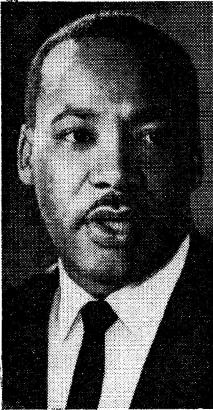
DR. MARTIN LUTHER KING