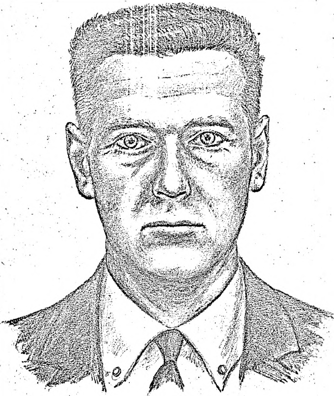
ARTIST'S SKETCH OF UNSUB.