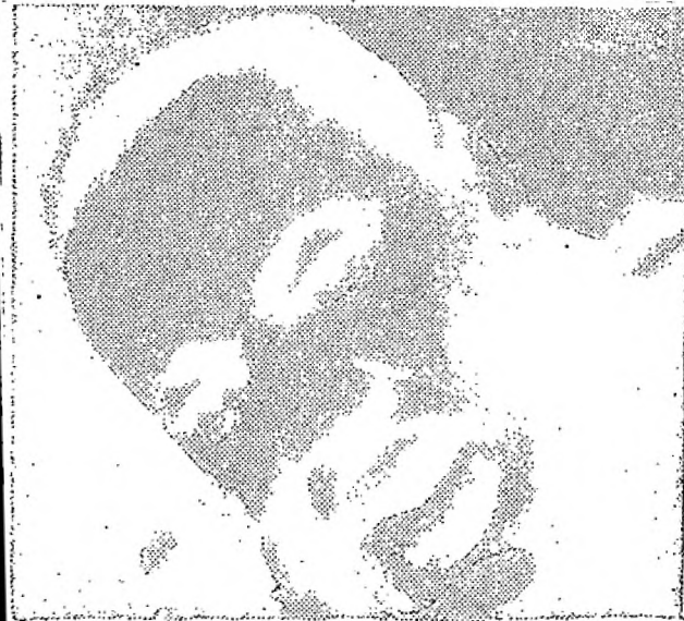
DR. MARTIN LUTHER KING

"Forty million persons perish on an isle of poverty in the midst of an ocean of prosperity. The Negro finds himself in the midst of a major depression.