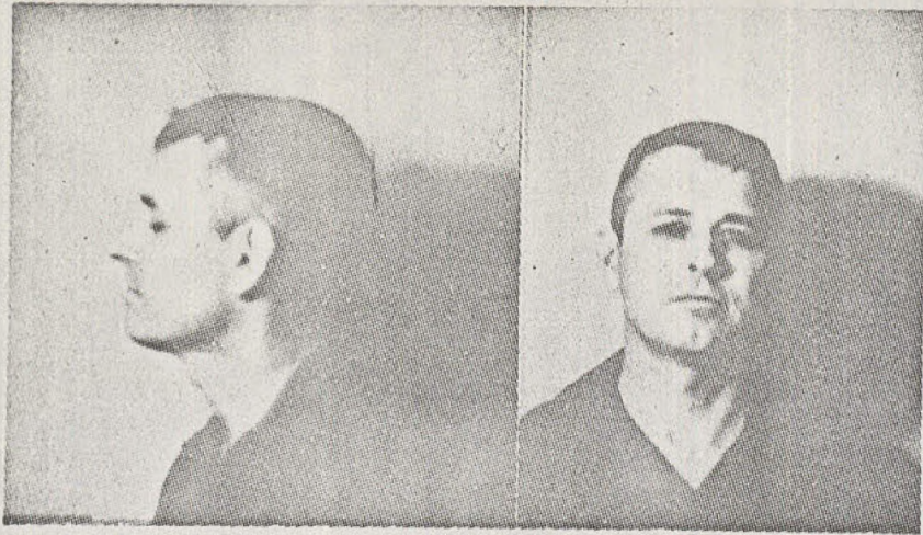
JAMES EARL RAY