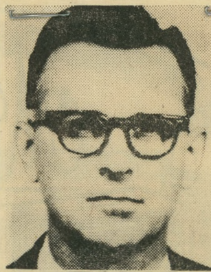
JAMES EARL RAY ... passport photo