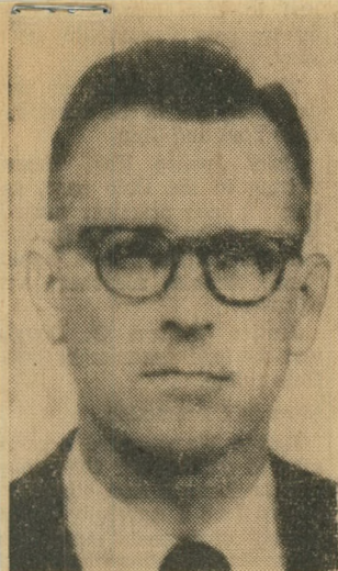
JAMES EARL RAY Passport Photo