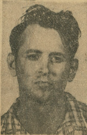
James Earl Ray