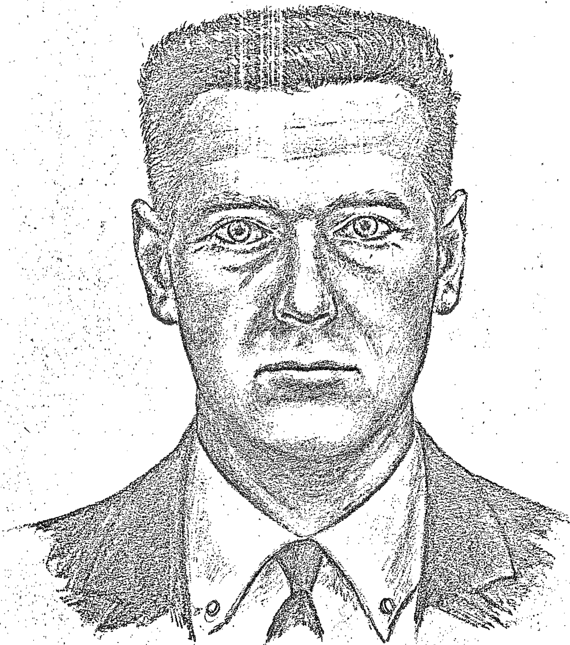
ARTIST'S SKETCH OF UNSUB.