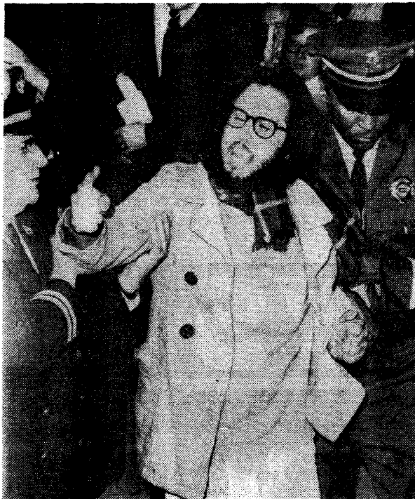
BEARDED HECKLER ESCORTED OUT ... He came to give Kennedy a bad time

At Scottsbluff and again in Norfolk, Kennedy introduced his new picture of future President Kennedy as a far-traveling leader responding to the will of the people.