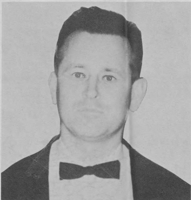
Photograph taken 1968 (eyes drawn by artist)