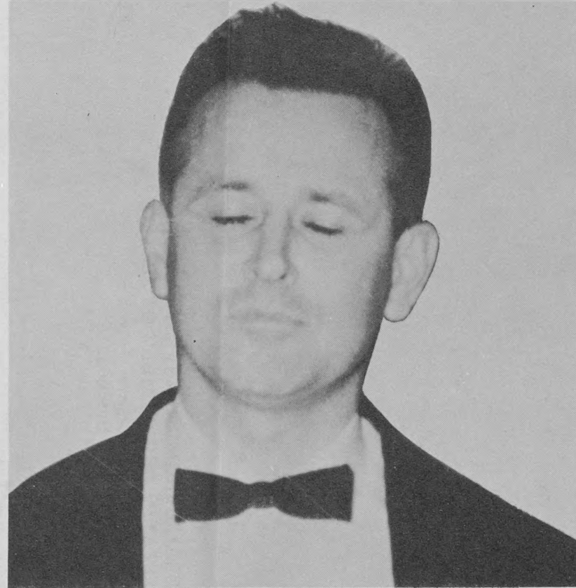
Photograph taken 1968