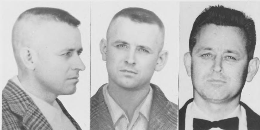
JAMES EARL RAY FBI No. 405,942 G