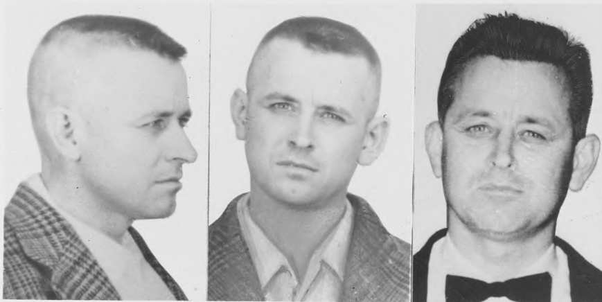
JAMES EARL RAY FBI No. 405,942 G