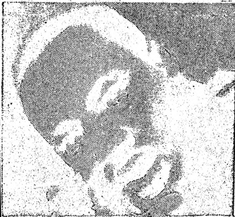
DR. MARTIN LUTHER KING

"Forty million persons perish on an isle of poverty in the midst of an ocean of prosperity. The Negro finds himself in the midst of a major depression.