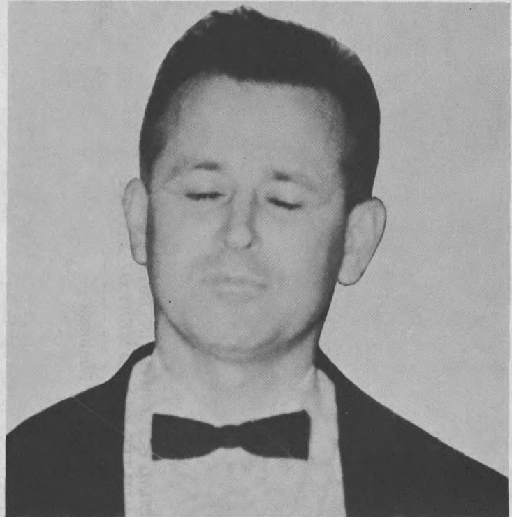
Photograph taken 1968