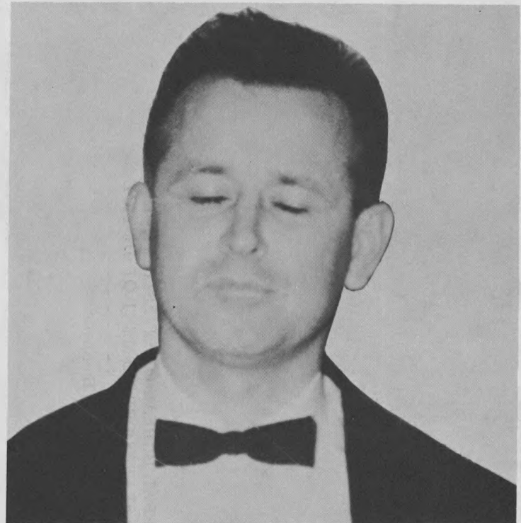
Photograph taken 1968