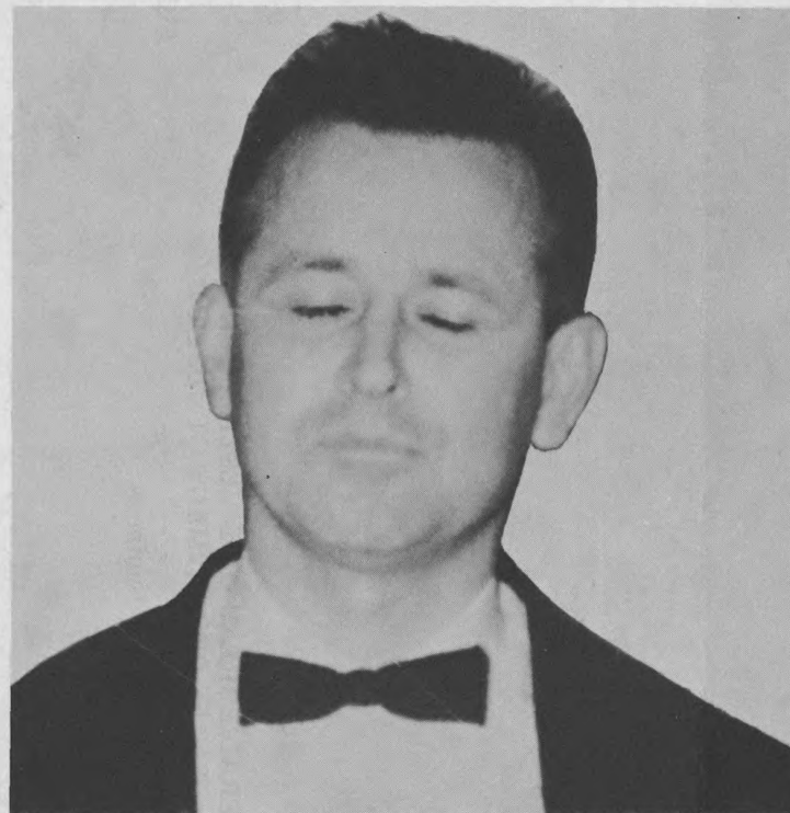
Photograph taken 1968