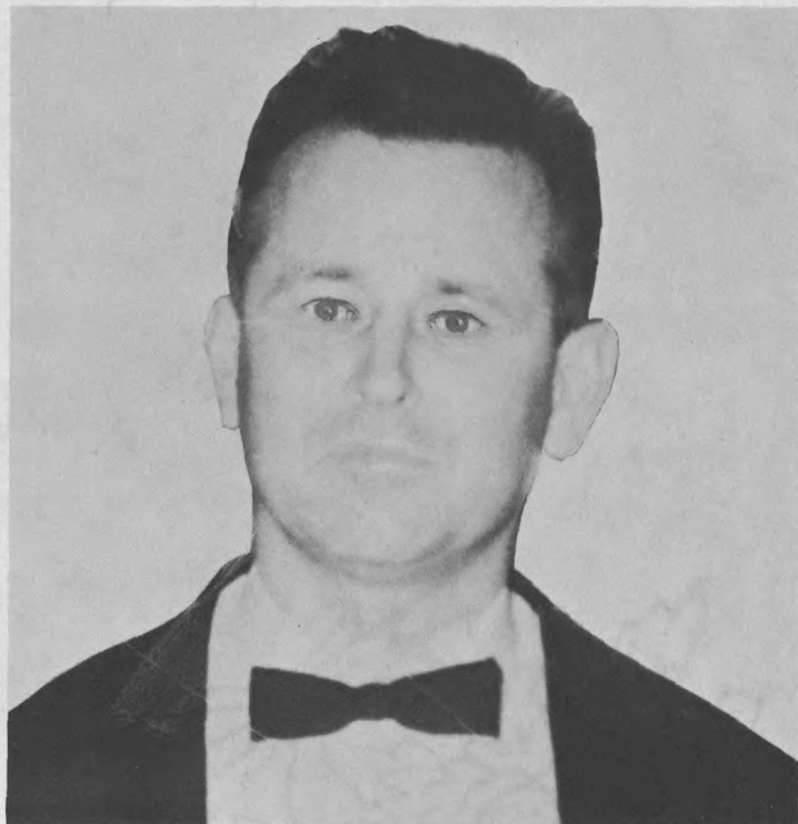
Photograph taken 1968 (eyes drawn by artist)