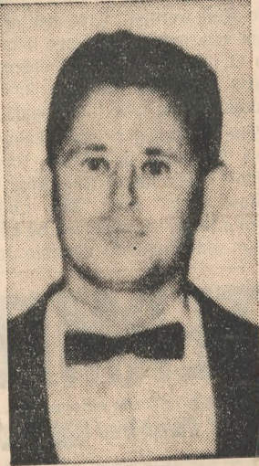
ERIC STARVO GALT ... charged in conspiracy