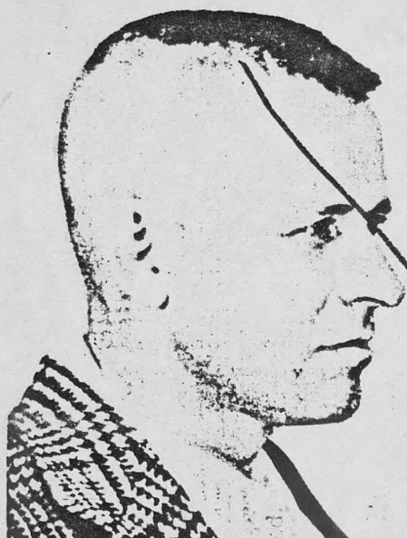
Photographs taken 1960