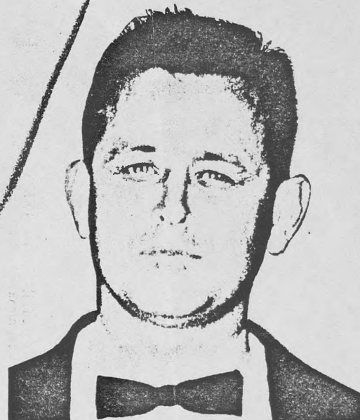
Photograph taken 1968 (eyes drawn by artist)

Aliases: Eric Starvo Galt, W. C. Herron, Harvey Lowmyer, James McBride, James O'Conner, James Walton, James Walyon, John Willard, "Jim,"