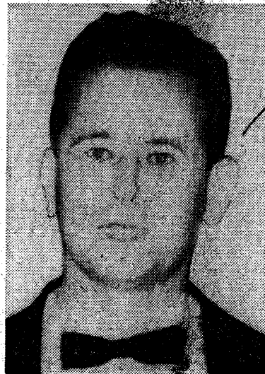
ERIC STARVO GALT

The FBI said a warrant was issued in Birmingham, Ala., Wednesday on the basis of an FBI complaint which charged that Galt and an individual, "brother," brother, engaged in a conspiracy to murder Dr. King.