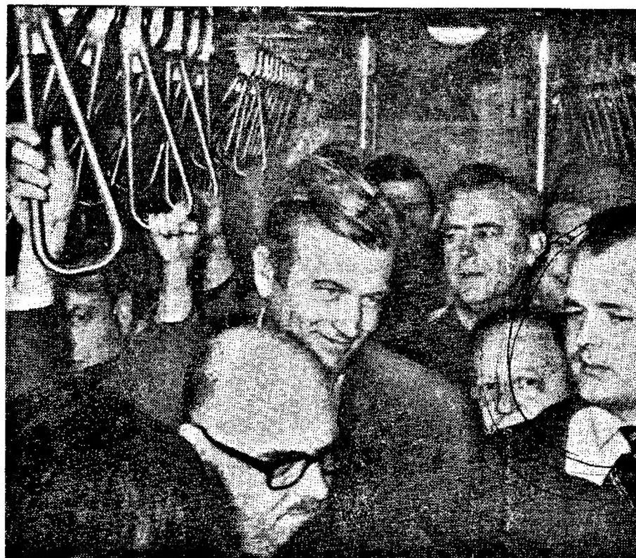
STRAPHANGING IN NEW YORK, Montreal's Mayor Jean Drapeau, wearing glasses, joins New York Mayor John Lindsay on a subway excursion. Drapeau is in U.S., promoting Man and His World exposition at last year's Expo site.

The skell, Fa. son's predece of the Labor warned of dire en velopments for Labor some of the East-Enders Left-wing Labor M were abused by work class constituents, some whom also hurled abuse