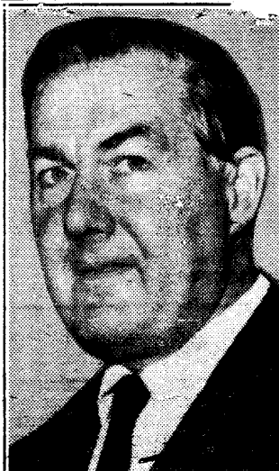
Home Secretary Callaghan He authorized proceedings.

But Scotland Yard detectives pointedly refrained from questioning him about King's murder to avoid complicating the case against him in the United States. American FBI agents have refrained for the same reason from asking permission to question him.