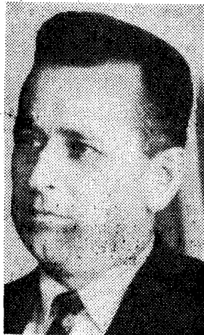
JAMES EARL RAY

dian passport listing him as Ramon George Sneyd. The FBI said he obtained the Canadian passport April 24 in Ottawa, Canada, where he apparently fled after King's assassination.