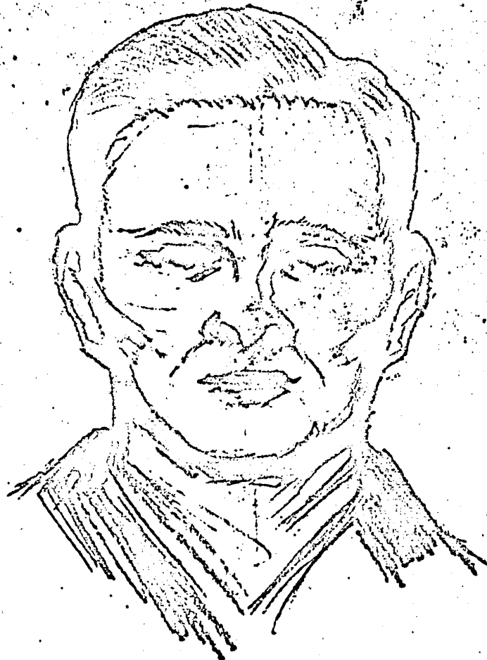
21 Nov 68: Photo of composite drawing of person GIESBRECHT overheard in Horizon Room 13 Feb 64.