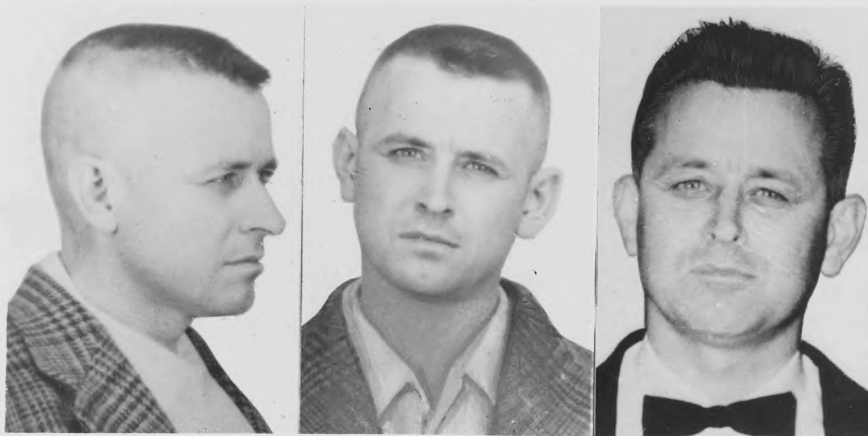
JAMES EARL RAY FBI No. 405,942 G