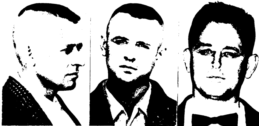
JAMES EARL RAY FBI No. 405,942 G