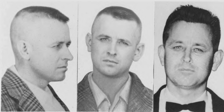
JAMES EARL RAY FBI No. 405,942 G