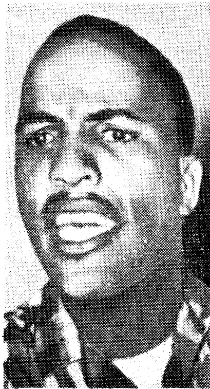
The Rev. James Bevel

Bevel said he was convinced of Ray's innocence before he